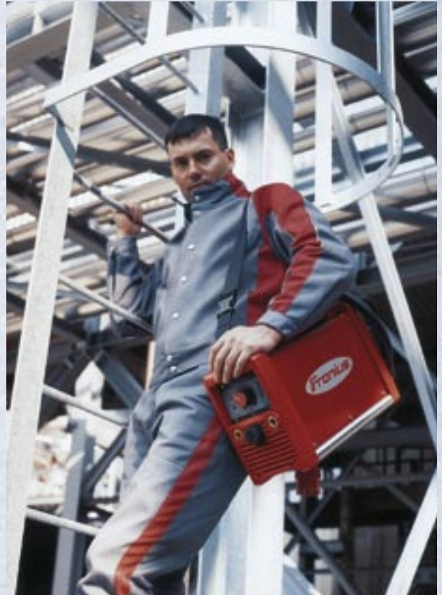
Lightweight and portable, and so right at home on every worksite.

The machines also feature a stand-by mode which lightens the load on the power source and uses 88 % less power than normal.