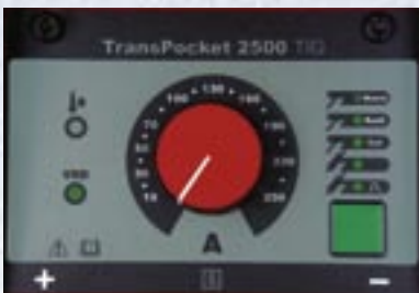
Manual electrode and perfect TIG welding with the TIG pulsed-arc function, for immaculate welds. Also features gas solenoid valve and remote-control connection.