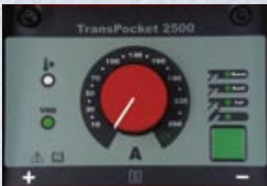
Manual electrode welding and extra TIG function. Large rotary knob for ease of operation even when wearing gloves

The carrying handle – integrated as standard – and the shoulder strap make it easy for you to take these sturdy lightweight units with you wherever you go. If you wish, you can operate your machine directly from the welding workplace using a convenient remote-control unit. The multi-operator rack lets you transport up to six machines at a time, in an easy and protected way, and includes a 6-way power distributor.