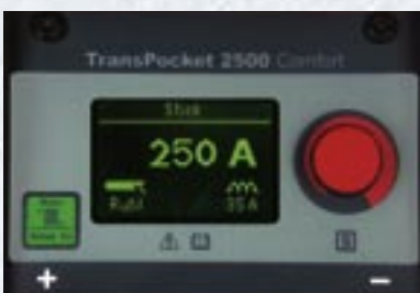
Easy menu navigation and plain-text display. Job Mode stores individual settings. Synergic Mode optimises welding parameters for freely selectable types and diameters of electrode.