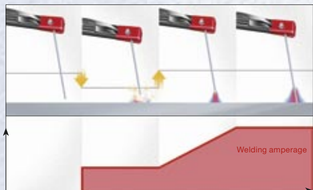
Soft-Start delivers a stable arc for basic electrodes that ignite at low welding amperages.